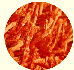
understanding client needs